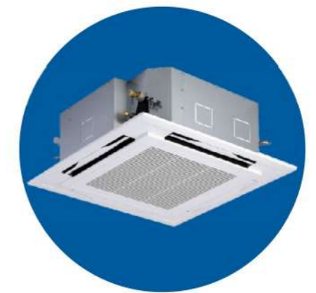
Cassette Type Unit 2 Ton - 4.25 Ton