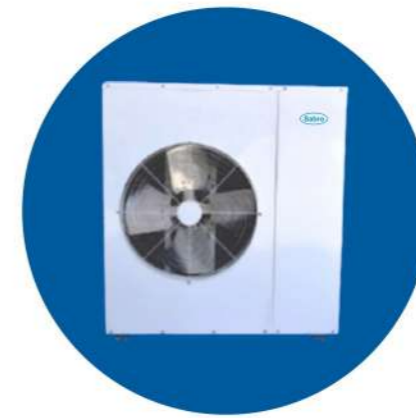
Outdoor Unit 1.5 Ton - 8.5 Ton