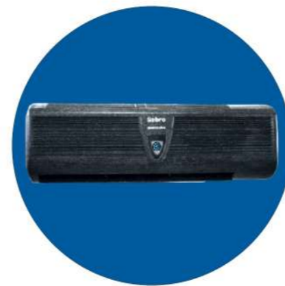
Wall Mounted Model 1.5 Ton - 2 Ton