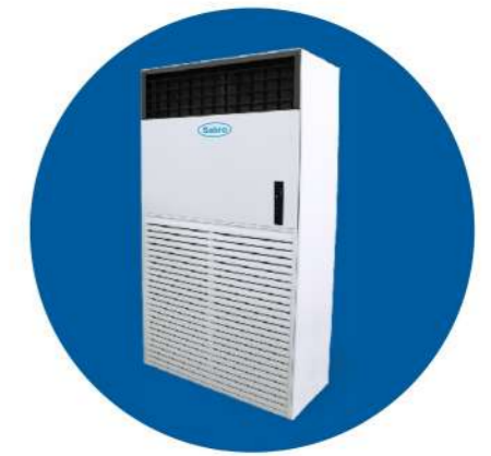
Floor Standing Unit 8.5 Ton