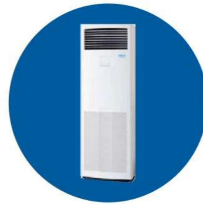
Floor Standing Unit 4.25 Ton